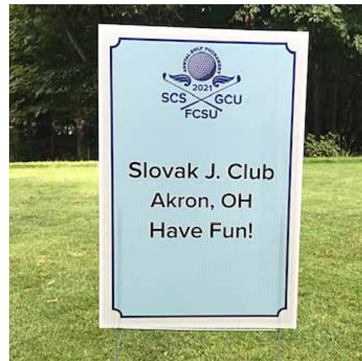
The Slovak J Club in Akron, OH, was one of the many sponsorship signs throughout the two 18- hole courses of Treasure Lake Golf Resort.