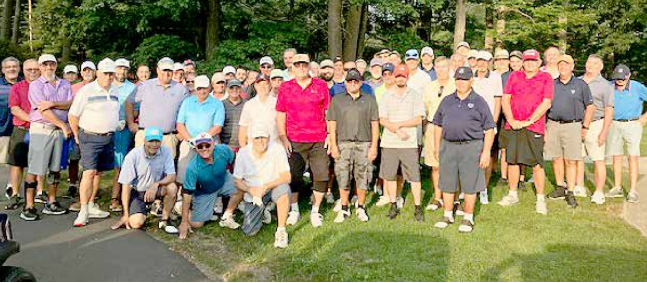
FCSU golfers gather for a group photo to complete the opening ceremonies of the tournament on a beautiful Saturday morning at Treasure Lake's Gold Course.