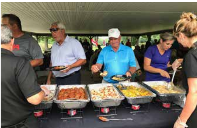
Members enjoying a catered banquet at the Silver Course Pavilion in Treasure Lake Resort.