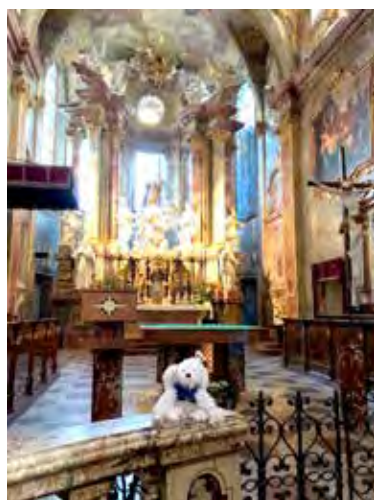
Chewy sitting in one of Niches in St Emerans Cathedral in Nitra