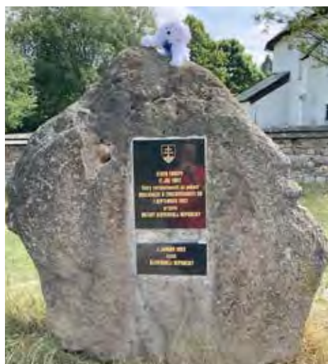
Site of St. John the Baptist Church in Kremnicke Bane Geographical center