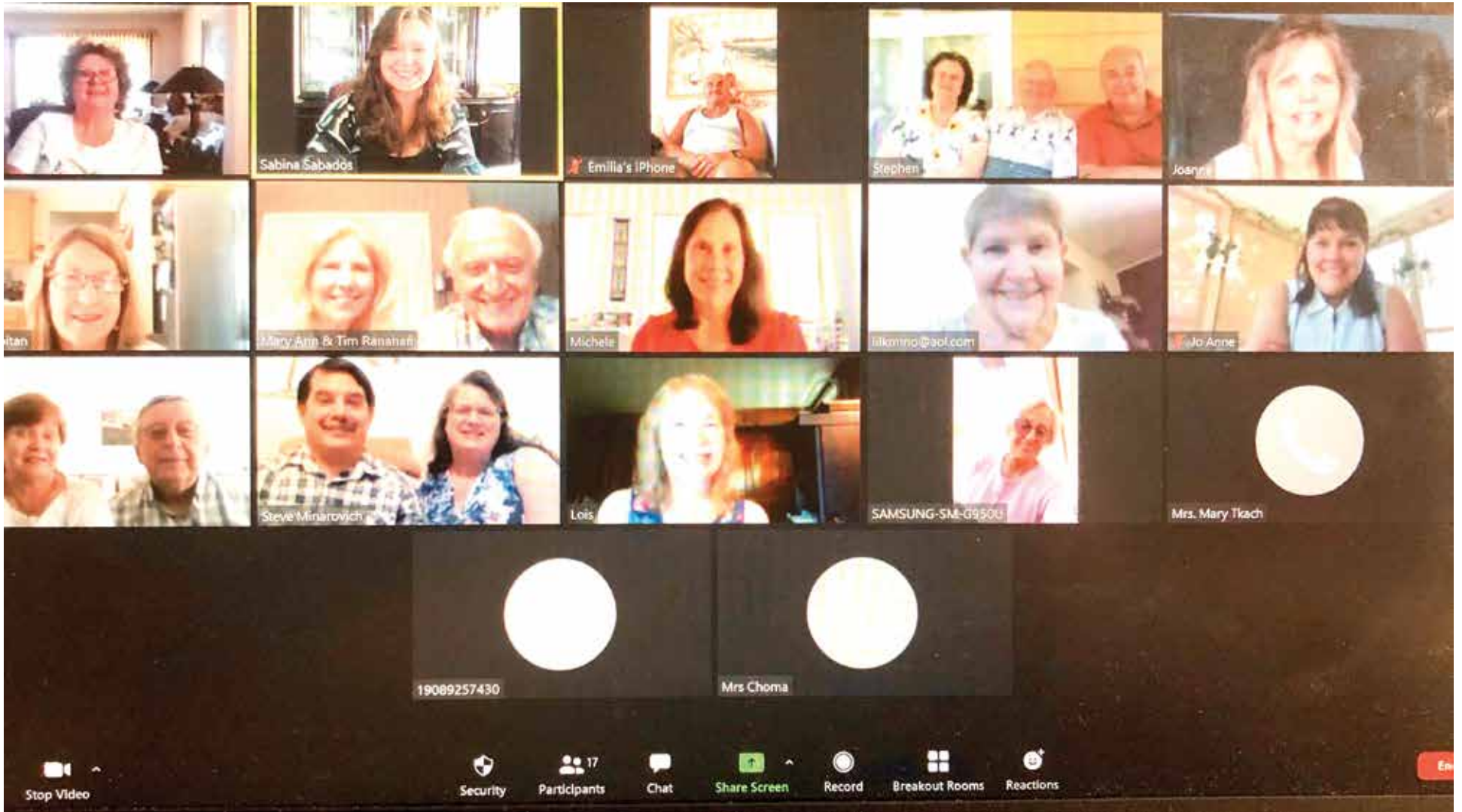
District 4 meets via the Zoom video platform