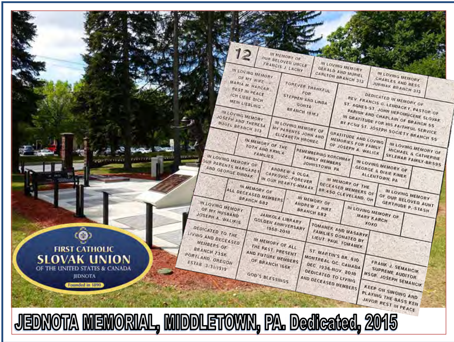
JEDNOTA MEMORIAL, MIDDLETOWN, PA. Dedicated, 2015

This is another of the latest panels to be completed. To view more complete panels, or if you haven't yet ordered your "brick" you can go to www.fcsu.com to Jednota Memorial to download your order form. Or you can request an order form by calling the FCSU Home Office at 1-800-533-6682.