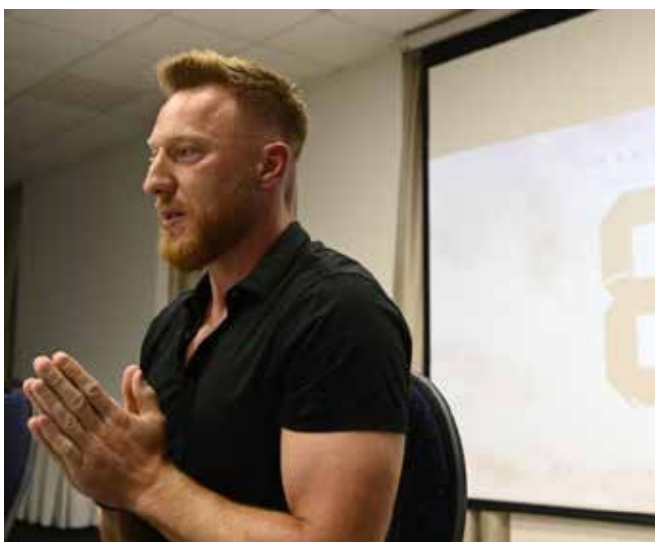
Slovenský hokejista Marián Hossa počas tlačovej konferencie k jeho zvoleniu do hokejovej Siene slávy NHL v kanadskom Toronte. Trenčín, 25. júna 2020.

Hossa odohral celkom 1309 základných zápasov v profile, strelil 525 gólov a pridal 609 asistencií. V play-off, on vstúpil 205 duel s rovnováhou 52 + 97. Je to jediný hráč v histórii NHL, ktorý hral tri sezóny v rade vo finále Stanley Cup pre tri rôzne tímy - Pittsburgh, Detroit a Chicago, v "jastrabovom" drese. "Chcel by som Mariánovi zablahoželať k vynikajúcej kariére. Vyhrál trikrát Stanley Cup a zjavne ho žiadny Slováčok už dlho nezvládne, aby sa zúčastnil celého slovenského hokeja, uviedol Šatan na stretnutí na hokejslovakia.sk portale.