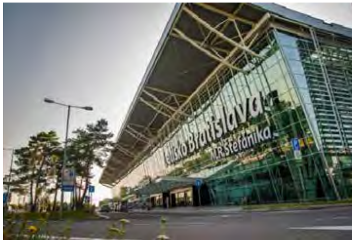
Letisko Bratislava Bratislava airport