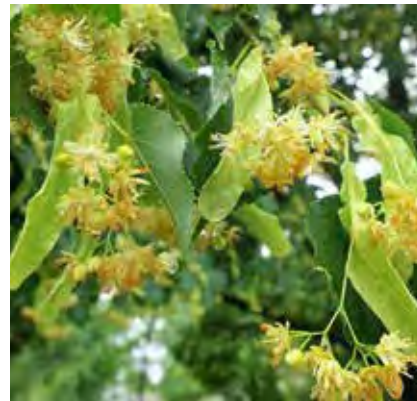
Blossoms on one of the linden trees found on the grounds of SS Cyril & Methodius in Danville, PA