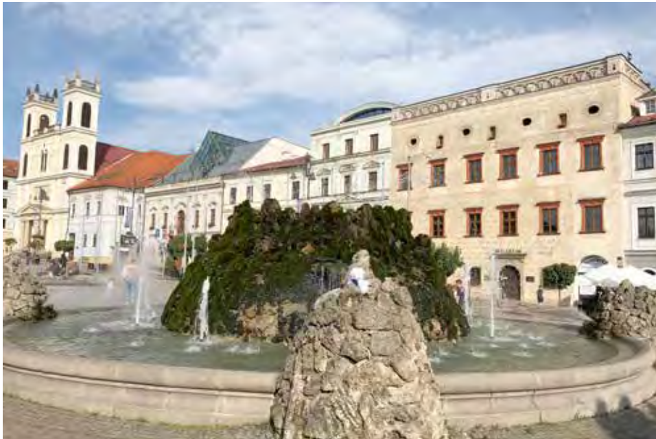
Chewy sitting atop rocks by the fountains with the town of Banská Bystrica in the background