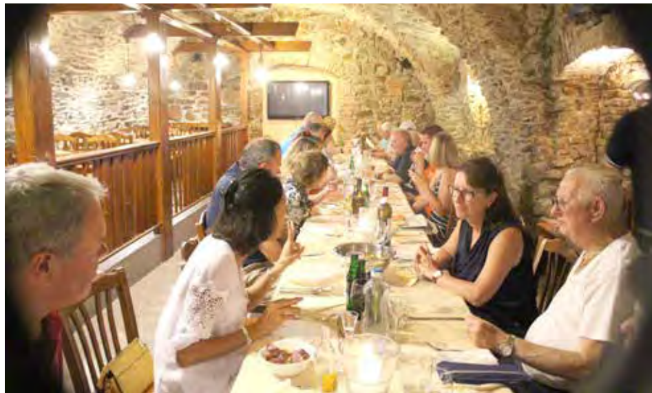
Farewell party in Pezinok

On the road again! After a good night sleep and a large breakfast as only the Slovaks know how to make, Chewy curled up and went right back to sleep with a full belly. Destination Nitra –to visit St Emeran's Cathedral built in 1660. This is a must see for anyone traveling to Slovakia. A long walk to the cathedral