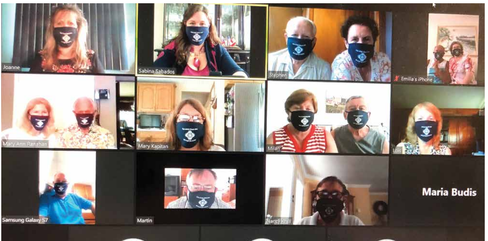
Branch 746 members modeled their new face masks!