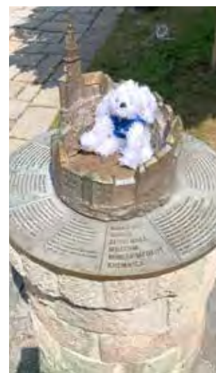
Chewy atop monument at Geographical center