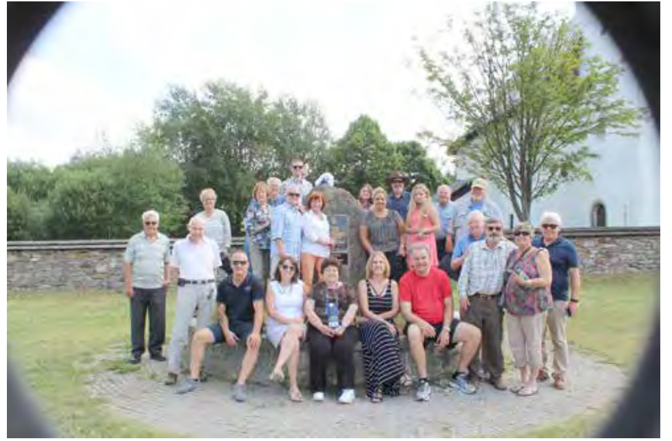
Group picture at the Geographical Center of Europe in Slovakia; note Chewy atop the monument