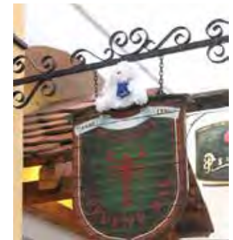
Chewy atop the Červený Rak sign in Banská Bystrica

but its beauty is well worth the walk. Half way up the hill, Chewy looked up with his beautiful canine eyes and we all knew he wanted to be carried the rest of the way. The niches in the cathedral are something to see and we have been privileged to hear the monks chant in them, and the tones are simply heavenly.