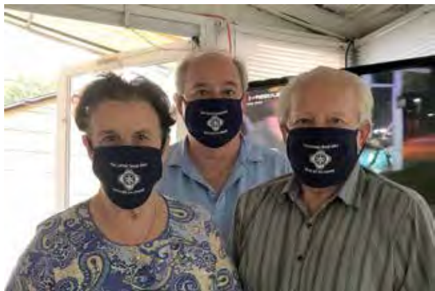
The Rada family wears their masks to church.