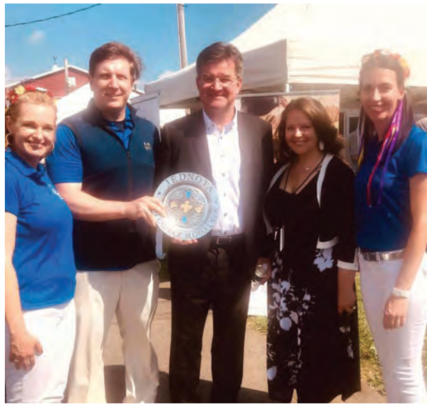
Slovakia's Minister of Foreign Affairs Miroslav Lajcak is flanked by members of the First Catholic Slovak Union presenting him with a commemorative plate.