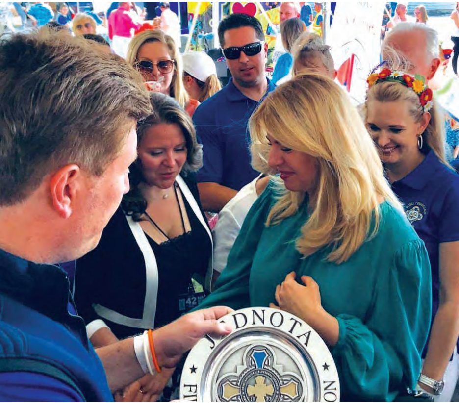
President of the Slovak Republic, H.E. Zuzana Čaputová receiving a commemorative plate from the First Catholic Slovak Union