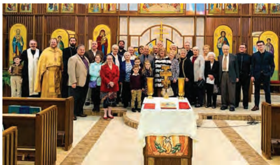
Attendees at the Slovak Byzantine Catholic liturgy celebrated at Holy Spirit Byzantine Catholic Church, Parma, OH.