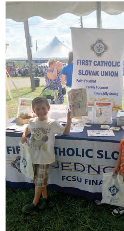
Branch 746 employing the young spreading the message about our s