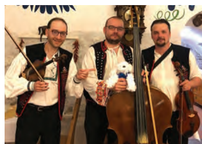
Chewy joins performers at Folklore Gardens on stage. A star is born!