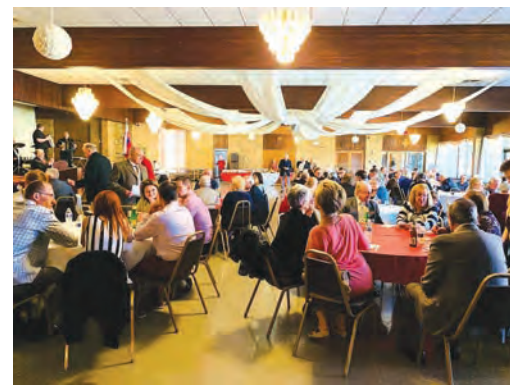
Members, friends and family helping to celebrate the 77th Anniversary of the American Slovak Zemplin Club at Holy Spirit Party Center in Parma, OH