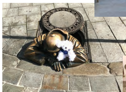
Chewy with Peeping Tom