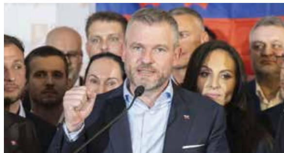
In the picture, Peter Pellegrini reacts to the preliminary unofficial results at the election headquarters on Sunday, April 7, 2024 in Bratislava.

Slováci si šiestykrát v histórii Slovenskej republiky volili prezidenta v priamych voľbách. Slovensko malo dosiaľ piatich prezidentov. Prvým bol Michal Kováč, ktorého však volil parlament. Priamo si občania volili hlavu štátu prvýkrát v roku 1999, vybrali si Rudolfa Schustera. Po ňom bol dvakrát na čele štátu Ivan Gašparovič. Nasledoval Andrej Kiska a dosiaľ poslednou prezidentkou je Zuzana Čaputová.