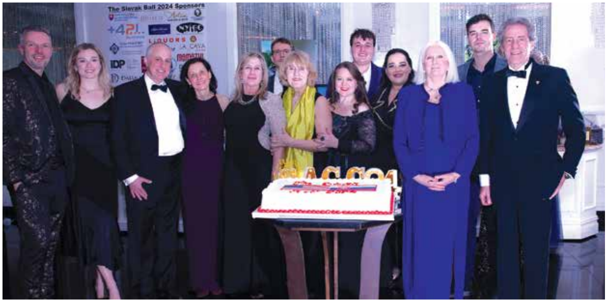
Slovak-American Cultural Center Board members of which many are also very active FCSU members.