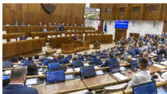
Pictured plenary during the meeting of the National Council of the Slovak Republic in Bratislava.

Prílohou novej zmluvy má byť prehľadná mapa a zoznam súradníc