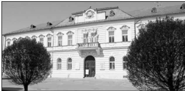
Slovenské literárne múzeum Martin.