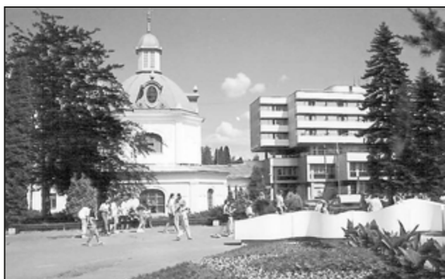
Kúpele Turčianske Teplice.