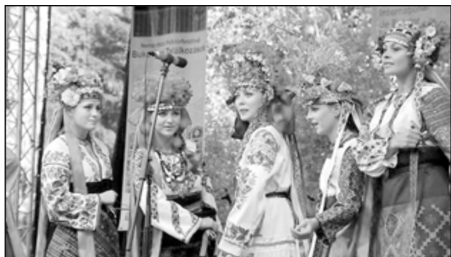
Kroj Turčianske Teplice.