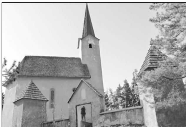
Kalvária v Kláštore pod Znievom.